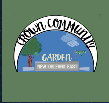
Crown Community Garden